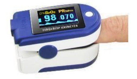
Figure 4. Put finger in position

finger is out. Intermittent alarm will occur and the user interface presents "FINGER OUT". Medium priority indicating that prompt operator response is required.