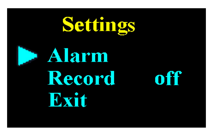
Figure 7. Main Menu Interface